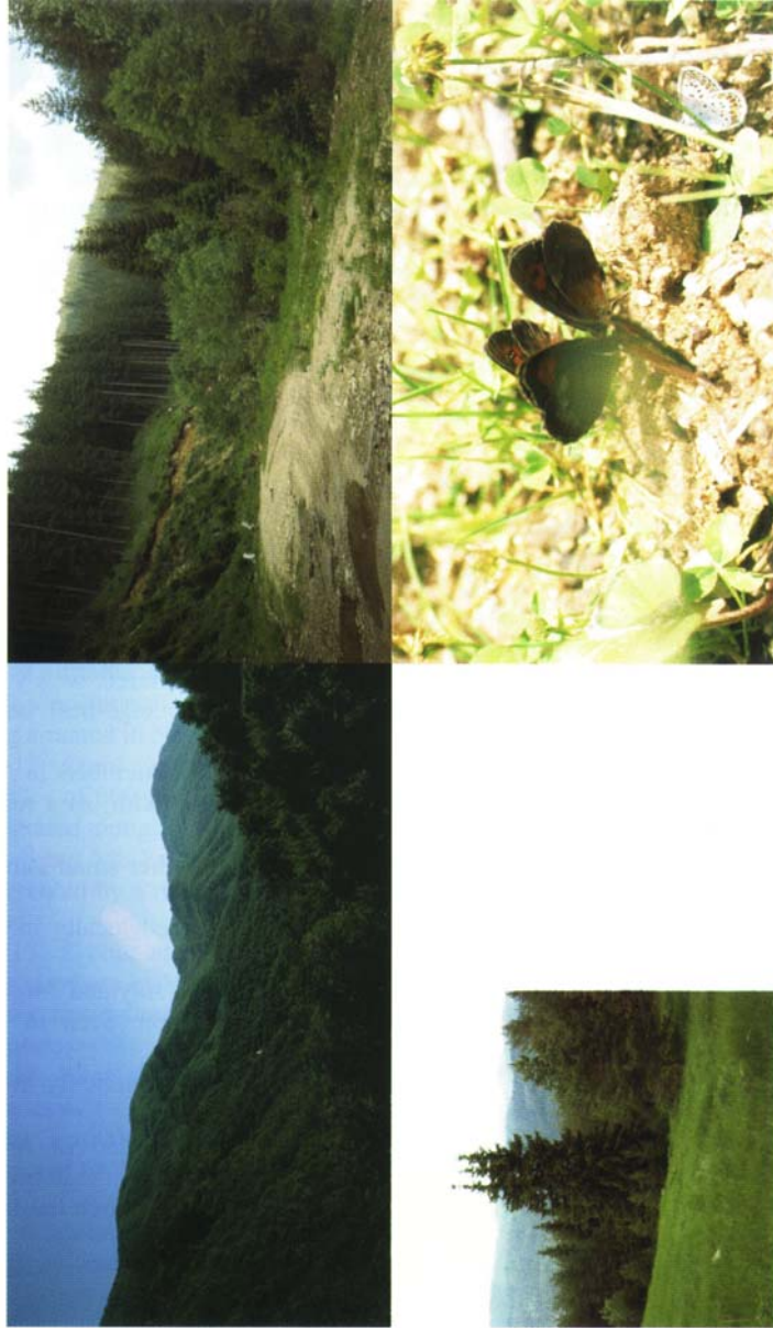
Figs. 1–4 : 1.– General view of the deciduous forest, 2.– An opening within the coniferous forest, composed mainly of Picea abies , 3.– A meadow edged by a mixture of Picea abies and Abies alba , 4.– Erebia aethiops (Esper, [1777]) together with a single male Plebeius argus (Linnaeus, 1758) sipping moisture.