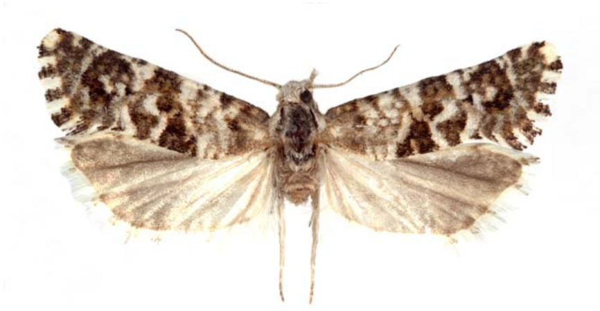
Fig. 1. Cochylimorpha salinarida n. sp. Holotype ♂, Spain, Alicante, La Marina, Platje el Pinet, 16.IX.2002, leg. Wolschrijn, coll. Zoological Museum of Amsterdam.

Labial palpus: inner side white with scattered brown scales, outside the white is slightly brownish and with scattered brown scales.