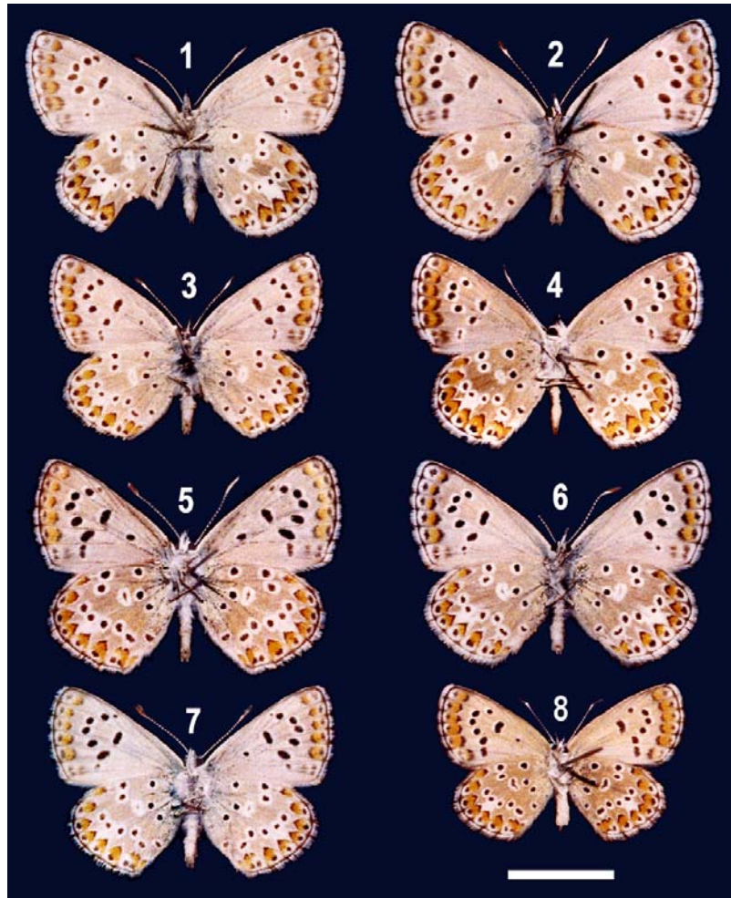
Fig. 2. Undersides of Plebeius ( Aricia ) anteros anteros (Freyer, [1838]) from Bulgaria. 1–7: ♂♂, 8: ♀; all Z. Kolev leg. et coll. 1– Mt. Alibotush, Hambar Dere gorge, 1600 m, 3.VII.1994; 2– Rhodopi Mts., Lukovitsa river gorge, 300 m, 11.VI.1994; 3.– idem, 22.VI.1991; 4.– Stara Planina Mts., Karandila nature park, 1000 m, 21.VII.1999; 5–8: idem, 22.IX.2002. Scale bar = 1 cm.

Hence it can be concluded that, as elsewhere in Bulgaria (pers. observ.), Greece (Coutsis 1983) and Turkey (Koçak 1983), the supposedly species-specific external characters as defined by Nekrutenko for anteros and orpheus are not only greatly variable but actually form a complete cline. The examination of the type population thus confirms that Nekrutenko's concept of " Aricia ( Ultraaricia ) orpheus " as a taxon distinct from anteros and constant in its characters is fallacious.