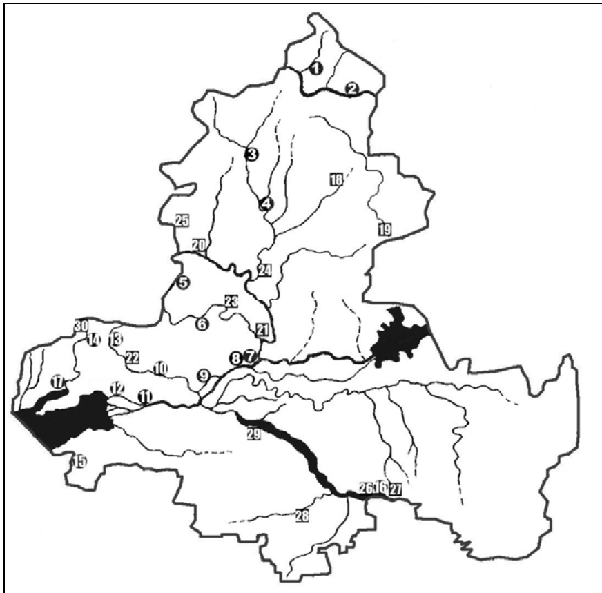
Figure 1. Entomological refuges in the Rostov-on-Don region: 1– Peskovatinsky, 2– Sholohovsky, 3– Millerovsky, 4– Efremovo-Stepanovsky, 5– Anikinsky, 6– Gornensky, 7– Kanyginsky, 8– Razdorsko-Pukhljakovsky, 9– Bessergenevsky, 10– Voloshino-Tuzlovsky, 11– Rostovsko-Temernitsky, 12– Nedvigovsky, 13– Lysogorsky, 14– Yasinovsky, 15– Alexandrovsky, 16– Volotchaevsky, 17– Darievsky, 18– Selivanovsky, 19– Oblivsky, 20– Kamensky, 21– Nizhnekundrjuchensky, 22– Bolshekrepsky, 23– Zaicevsky, 24– Belokalitvensky, 25– Mitjiakinsky, 26– Ostrovnoj, 27– Krasnopartizansky, 28– «Bread ravine», 29– Krasnomanytchsky, 30– Kuibyshevsky. ● – well investigated, ■ – insufficiently investigated.

constantly applied. Technologies of plant protection, which used in the Rostov-on-Don region, assume annual spraying a significant volume of insecticides: on one hectare of wheat 1.1–2.72 liters; on sugar beet 2.25 liters; on peas 3.1 liters; in orchard 10–12 liters. Insecticides, among which dominate phosphororganic and pirethroid preparations, are the constant threat for the stability of the natural ecosystems in the steppe zone of Russia and especially by avia-application.