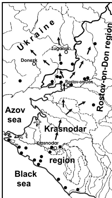
Fig. 7. Supposed directions of the expansion of Tarachidia candefacta in the south of European Russia and the localities where the species has been observed.