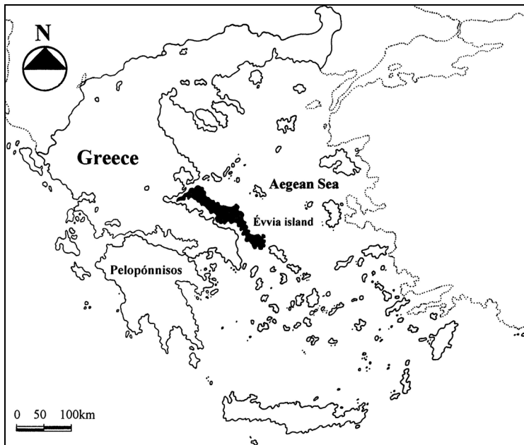
Fig. 1. Map of Greece showing location of Évvia island.