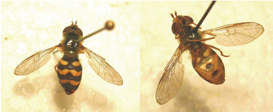
Fig. 1: Dorsal (left) and ventral (right) view on female Eupeodes goeldlini from Bonheiden 28.V.1998.