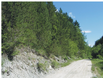
Figs. 2–5. Polyommatus escheri (Hübner, 1823). 2.– Male upperside, Tazhevo near Kozjak Lake; 3.– Female underside, idem; 4.– Larval foodplant, Astragalus monspesulanus , idem; 5.– Locality near Majdan village in Kožuf Mts. where adults of P. escheri were observed along the road side.