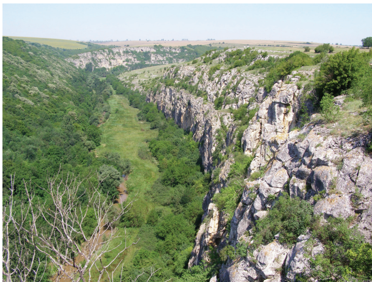
Fig. 5. Habitat of Odontognophos dumetata (Treitschke, 1829); Bulgaria, Roussenski Lom Natural Park, Tcherni Lom River, near Tabachka Village.