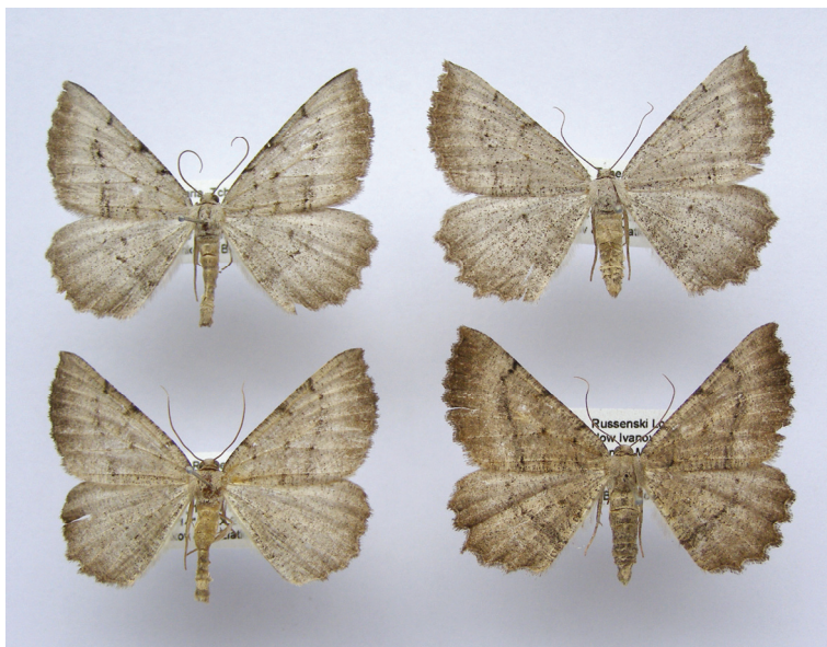
Figs. 1–4. Odontognophos dumetata (Treitschke, 1829); 1.– Tchepun Ridge above Dragoman Town, 15.IX.2007, male; 2.– Idem, female; 3.– Roussenski Lom below Ivanovo Village, "Pismata", 01.X.2007, male; 4.– Idem, female.