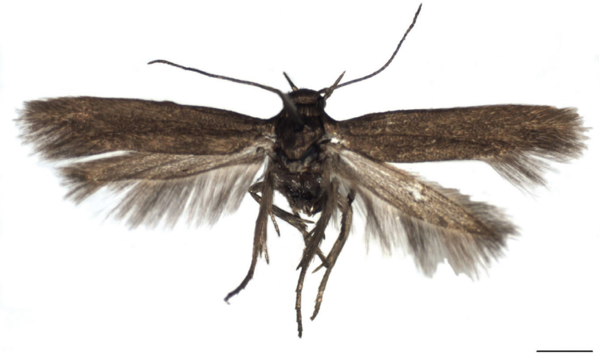
Fig. 1. Scythris potentillella (Zeller, 1847). Belgium, Province of Limburg, Lommel, 26.vii.2008, leg. F. Groenen. Scale bar 2 mm.