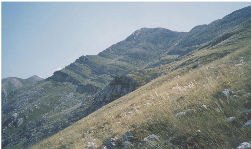
Fig. 20. Typical habitat of Pseudochazara graeca in southern Greece (Mt. Taiyotos).