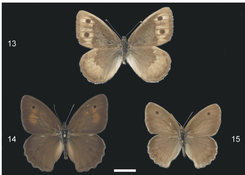
Figs. 13–15. ♂, upperside, Greece. 13.– Pseudochazara graeca (light colored), Ípiros, Pindos Mts., Katára Pass, 1600 m, 8.viii.1974; 14, 15. Hyponephele lycaon . 14.– Pelopónnisos, Mt. Taíyetos, 1300 m, 9.vii.1998; 15.– Makedonía, Mt. Pangéio, 1500–1800 m, 6–7.viii.1979. Scale bar: 1 cm.