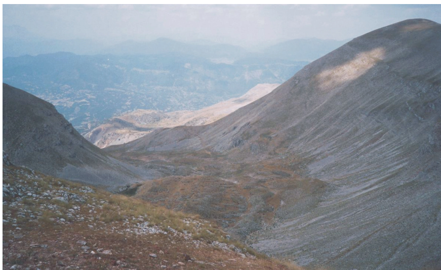
Fig. 21. Typical habitat of Pseudochazara graeca in north-western Greece (Mt. Lákmos).