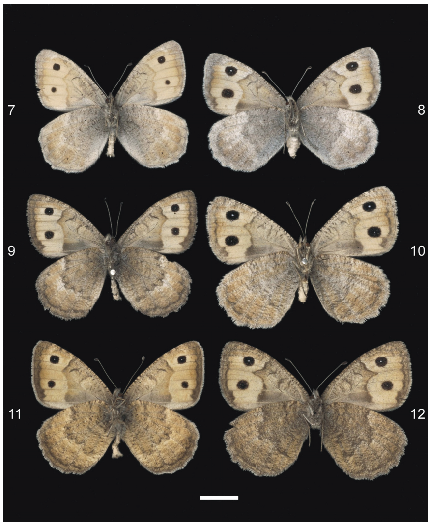
Figs. 7–12. Pseudochazara graeca , Greece, underside. 7, 9, 11. ♂. 8, 10, 12. ♀. 7.– Stereá Ellás, Mt. Parnassós, 1800 m, 26.vii.1964; 8.– Évvia Island, Mt. Dirfís, 1200–1300 m, 5.viii.1979. 9.– Thessalía, Ágrafa Mts., Mt. Zigurolivado, 1650 m, 29.vii.2008; 10.– Thessalía, Ágrafa Mts., Mt. Karáva, 1750 m, 29.vii.2008; 11, 12.– Ípiros, Píndos Mts., Katára Pass, 1600 m, 17.viii.1976. Scale bar: 1 cm.