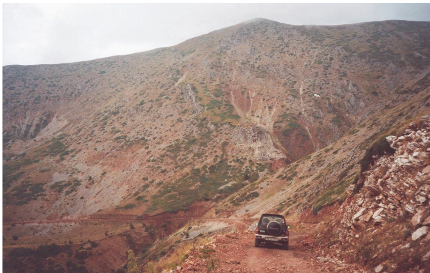
Fig. 22. Typical habitat of Pseudochazara graeca in central Greece (Mt. Zigurolivado).