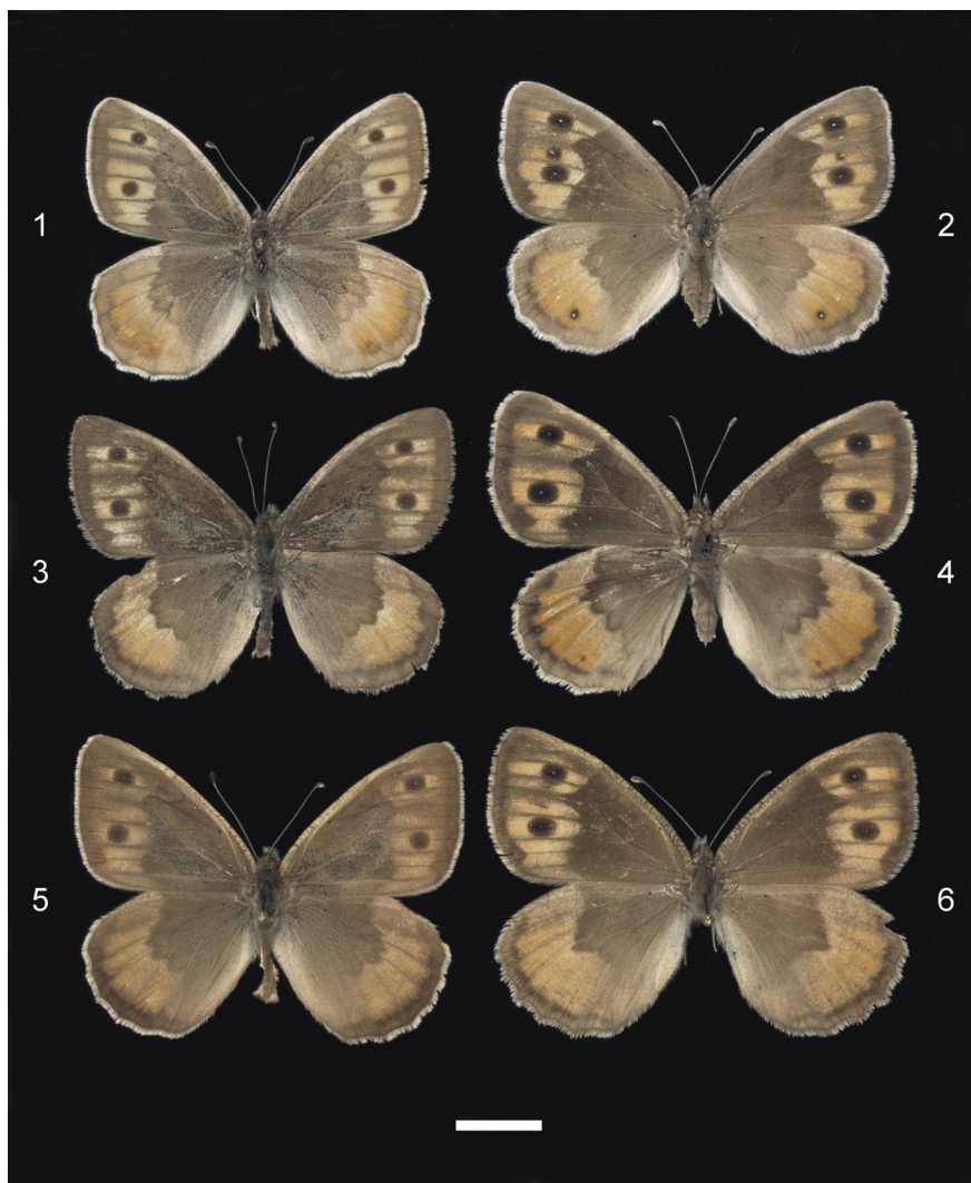
Figs. 1–6. Pseudochazara graeca , Greece, upperside. 1, 3, 5. ♂. 2, 4, 6. ♀. 1.– Stereá Ellás, Mt. Parnassós, 1800 m, 26.vii.1964; 2.– Évvia Island, Mt. Dírfis, 1200–1300 m, 5.viii.1979; 3.– Thessalía, Ágrafa Mts., Mt. Zigurolívado, 1650 m, 29.vii.2008; 4.– Thessalía, Ágrafa Mts., Mt. Karáva, 1750 m, 29.vii.2008; 5, 6.– Ípiros, Píndos Mts., Katára Pass, 1600 m, 17.viii.1976. Scale bar: 1 cm.