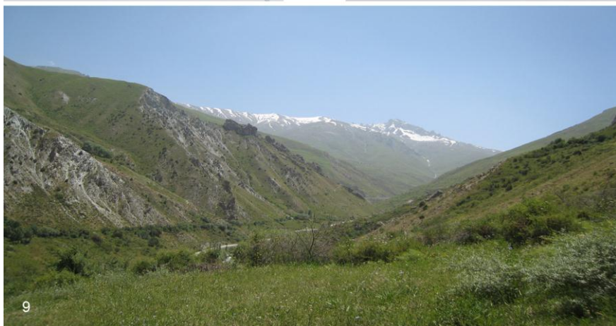
Fig. 7. Male genitalia of Bembecia lingenhoelei sp. n. , paratype, Tajikistan, Region Sughd, 3 km SE of Anzob, 2150 m, 16.VII.2009, leg. T. & J. Garrevoet, prep. TG2010-005. Scale bar 1 mm.