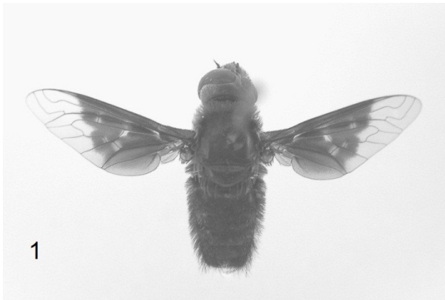
Fig. 1. Thyridanthrax maroccanus n. sp., Morocco, Ouarzazate, Skoura, 1250 m, 08.iii.2007, leg. J. Dils. coll. J. Dils.

In the spring of 2007, East of Skoura, near a dry oued, we found for the first time some nearly completely black Thyridanthrax with white scales at the apex of the abdomen, they could not be identified with the normal Thyridanthrax keys. Also the examination of the genitalia was not helpful to identify them. They were visiting blue flowers. The papers consulted to classify the new species are: Engel in Lindner (1937), Sanchez Terron & Roldan Bravo 2000; Zaitsev (1998, 2008).