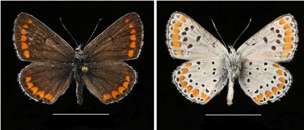
Fig. 2. Aricia agestis ♂. Greece, Dodekánisa, Sími Island, Xísos, 390 m, 2.vi.2012. Left. Upper side. Right. Underside. Scale bar = 1 cm. (Black spots appearing on FW underside in or near cell are caused by holes made by pins during setting).