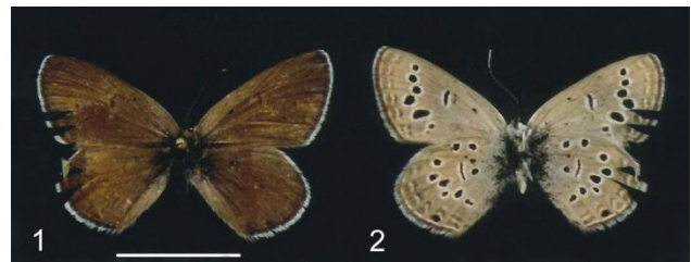
Figs 1, 2. Turanana durranii sp. nov.: male holotype, Afghanistan, Band-e Amir, 3000 m, 4.vii.2009, I. Pljushch leg. 1. Upper side. 2. Underside. Scale bar = 1 cm.

follow the usual Turanana pattern, but FW postdiscal black spot in s3 weakly displaced distad; submarginal row of lunulate spots – other than the black one in s2 of HW – and submarginal row of crescents, basad of former, slightly darker grey-brown than ground-colour; space between these two rows filled with almost imperceptible yellowish-orange tinge.