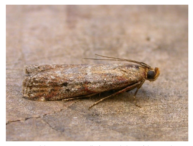
Figure 2. Delplanqueia inscriptella (Duponchel 1936) leg. Workgroup Lepidoptera Faunistics, det. Steve Wullaert.

In Europe D. inscriptella is considered to be more of a southern species than its counterpart D. dilutella . For the time being this appears to be an educated guess since the recent split and similar external features of both species render the existing knowledge of either species uncertain. In Belgium Delplanqueia species are typically found on dry, calcareous grasslands in the southern half of the country where their foodplants, Thymus sp. and possibly Polygala sp., are abundant.