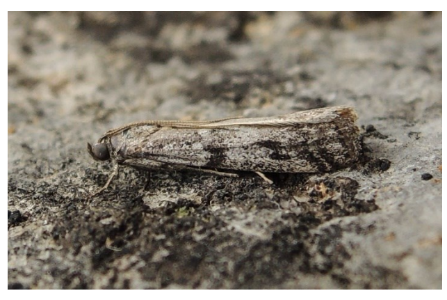
Figure 1. Ephestia welseriella (Zeller, 1848) leg. Workgroup Lepidoptera Faunistics, det. Dan Slootmaekers. © Dan Slootmaekers.

E. welseriella mainly occurs in de Mediterranean area. The observation we mention here as well as observations from southern Germany and Ukraine indicate that the species most likely reaches the northern-most boundary of its distribution in Belgium. This is underlined by the fact that we found a good number of specimens in Belgium but all in the south and on warm and dry calcareous grasslands, known to have their own microclimate, resembling climates of southern Europe. The species has been recorded from Albania, Austria, Bosnia & Herzegovina, Bulgaria, Croatia, France (incl. Corsica), S Germany, Greece (incl. Crete), Hungary, Italy (incl. Sardinia, Sicily), Malta, Portugal, Romania, S European Russia (incl. Caucasus), Spain, Switzerland, and Ukraine (Speidel et al. 2013). Outside Europe E. welseriella occurs in Algeria, Libya, Morocco and Tunisia (Leraut 2014).